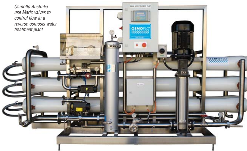
Osmoflo Australia use Maric valves to control flow in a reverse osmosis water treatment plant